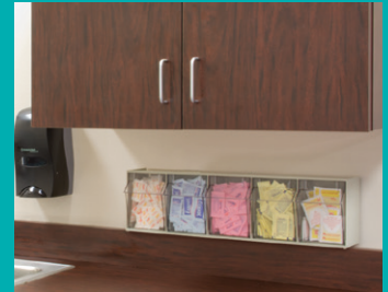
Bins keep contents clean and dust-free.