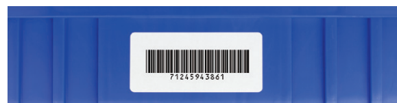
29203 Adhesive Label