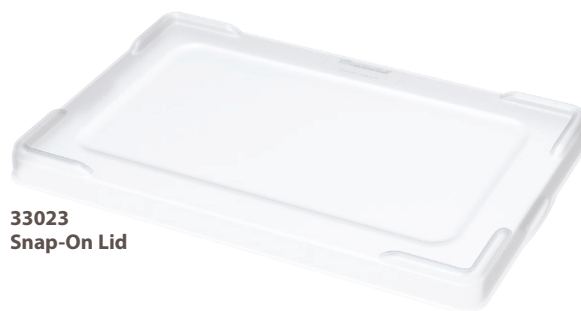
33023 Snap-On Lid