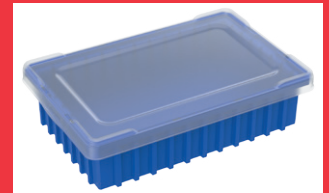
Snap-on lids keep items dust-free.