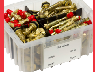
Label Holders snap in securely on any side.