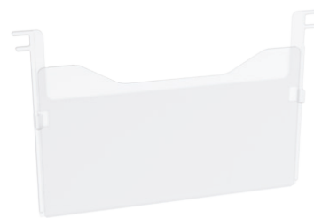
35011 Label Holder