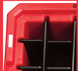
Grids are molded with a letter/number system for easy parts tracking.