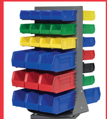
Holds multiple sizes of AkroBins®.