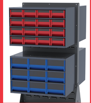
Holds up to four 19-Series Cabinets.