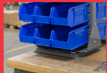
Can be permanently mounted to any work surface for added stability.